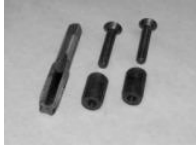
Nylon Bar End Mount Kit Best handguard mounts...period!