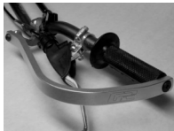
Competition Handguard System Unique clamp design allows better cable routing!!