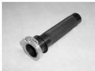
Billet Replacement Throttle Tube 2 piece design allows cam adjustability!