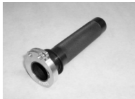
Quick-Turn Throttle Tube Opens faster than stock!

Here is our full range of G2 products. To order or learn more, please log on at www.g2ergo.com .