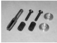
Billet Grip Protector Stop changing grips after every wipe-out!